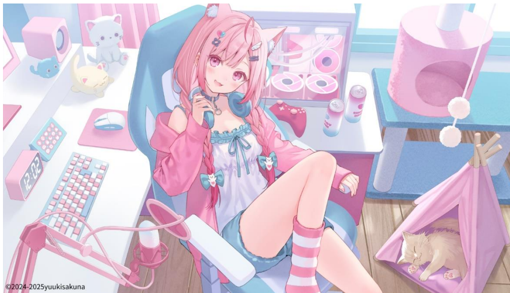
illustrated by fukahire ( @fuka_hire )

Gaming rooms for Yuki Sakuna, a popular Vtuber with over 1 million channel registrants, will be reproduced in Pixio booths. This is a cute space with pinks, light blue, and white tones that will excite not only fans but everyone, and you can see coordination with a focus on Pixio products. A life-size panel of Yuki Sakuna will also be set up, and you can enjoy taking a commemorative photo with her.